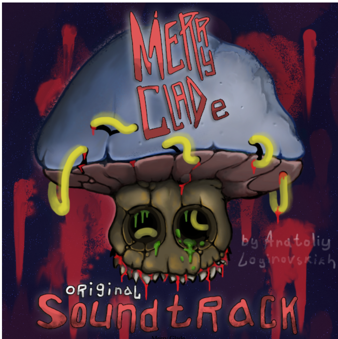
Merry Glade Original Soundtrack.